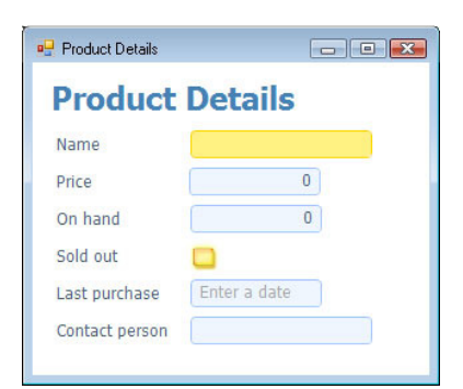
Figure 1: Sample screenshot of Product Details form